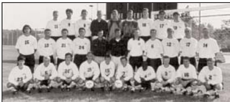
The 1998 NCAA Division II Quarterfinalist Team.