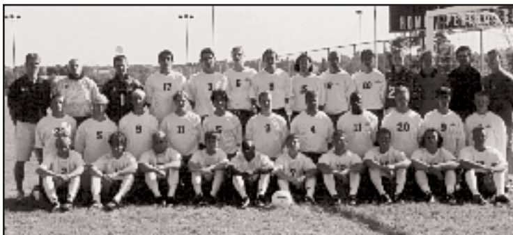
The 1997 NCAA Division II Semifinalist Team.

Prior to the 1997 run at the Division II championship, Truman had made the NCAA playoffs three times, losing to Oakland (Mich.) twice and Mercyhurst (Pa.) once.