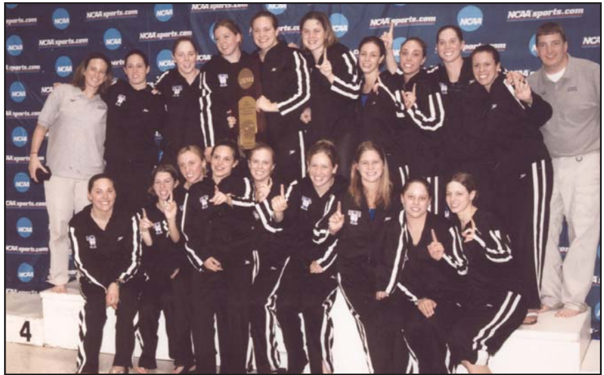
The women's team celebrates its fourth consecutive NCAA Division II title in Buffalo, N.Y. For the second straight year, all 18 members of the national team earned all-American honors by placing among the top 16 in at least one event.

The Bulldogs' depth also helped the team dominate the relay events. Truman won three of the five relays, finished sec-