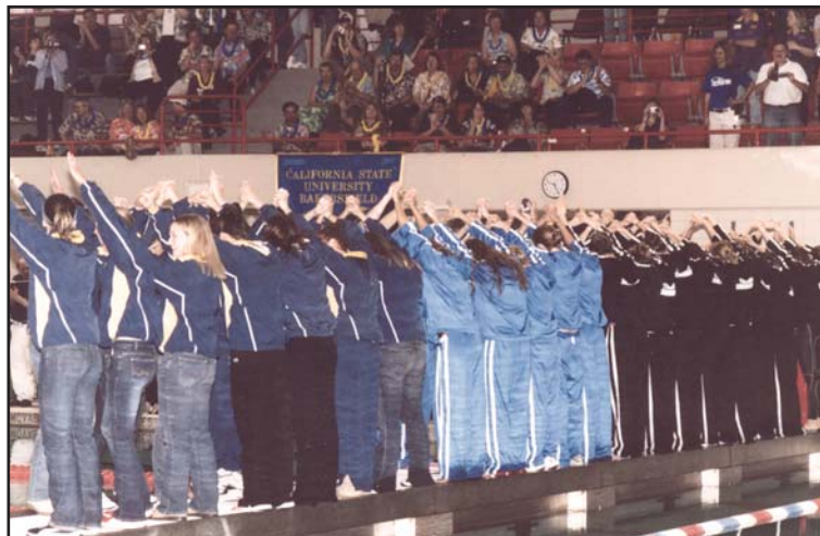
The tunnel of champions is formed across the bulk-head in Buffalo, NY. Truman defeated second place Drury University, 641-561.