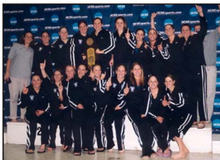
2004 NCAA Champion Women's Swimming Team

The Truman State University athletics department has a rich history of success and recently, has become one of the top all-around athletics departments in NCAA Division II -- both for their student-athletes achievements on the field and in the classrooms.